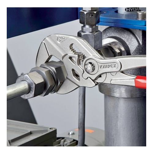
replaces the need for sets of metric and imperial spanners